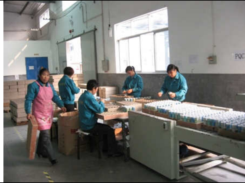
Lamp tube cementing