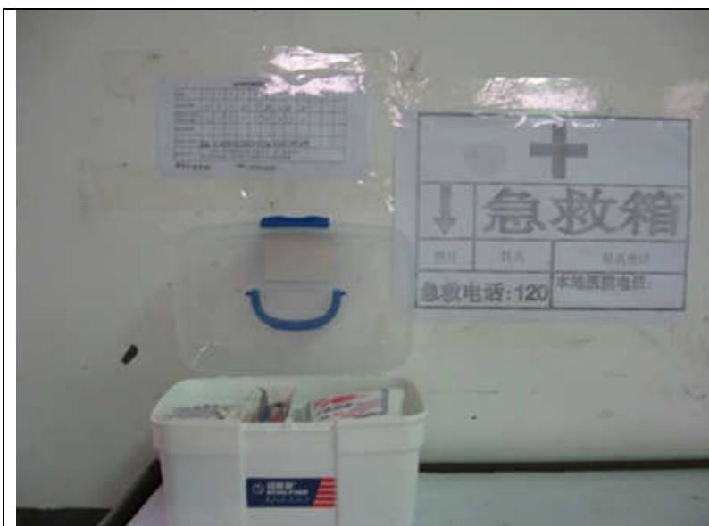
First aid supplies