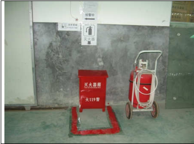
Fire protection equipments