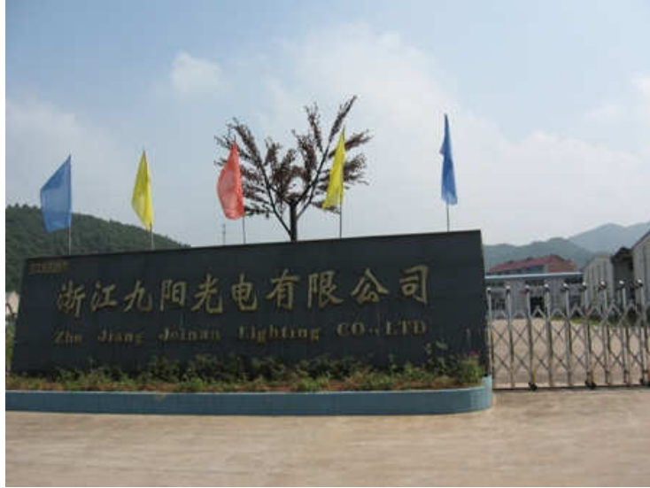
The front of the factory